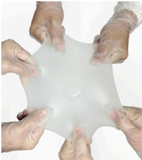
Figure 1: TrueMonoblock technology demonstrating that Shell/Gel/Patch behaves as a single very elastic unit, which allows smaller surgical incisions.