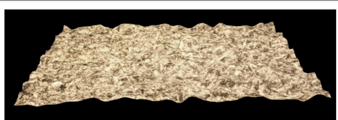
Figure 3: Silk Surface at 50X magnification demonstrating the dense population of the nano textured surface with 8000 points of contact per cm 2 .